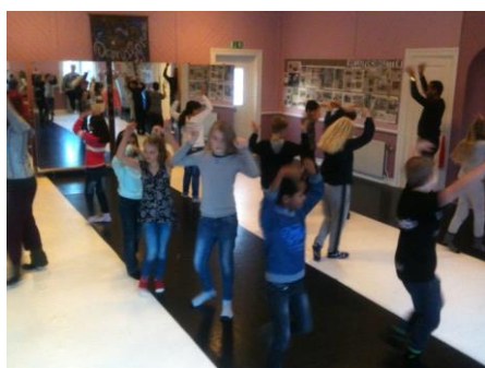
Children dancing curricular subjects in Sweden

In particular, the expanded practical section of activities include 36 practical exercises for the teachers to develop with their students, i.e.: learning science through dance, learning geography through new media arts, learning mathematics through music, etc.